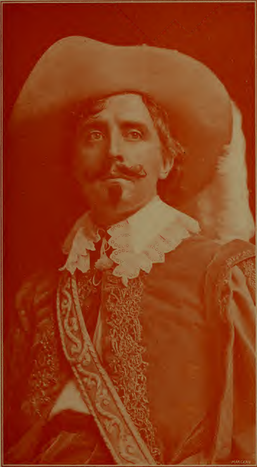
E. H. Sothorn as Richard Lovelace.